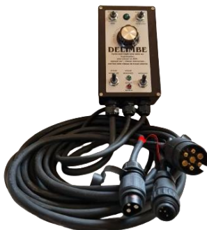
ISO PLUG 7 PIN

The red light comes on if your DPA is deprogrammed or if you are stopped with the tractor.